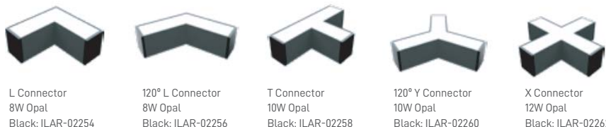
L Connector 8W Opal Black: ILAR-02254