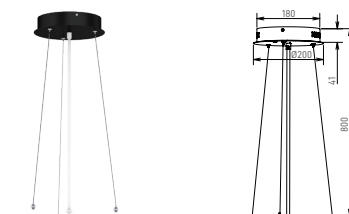
ILAR-02048 Kit de Suspensão IP40